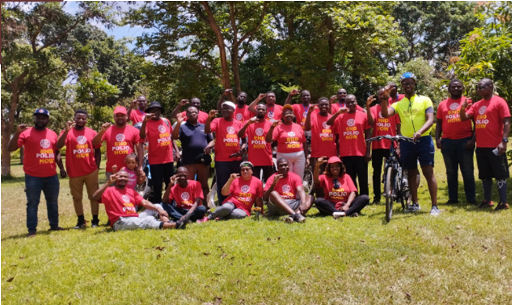
R4H Couriers & Staff posing with members of The Rotary Club of Bwaila, Lilongwe & Bikers Anonymous after a successful campaign.