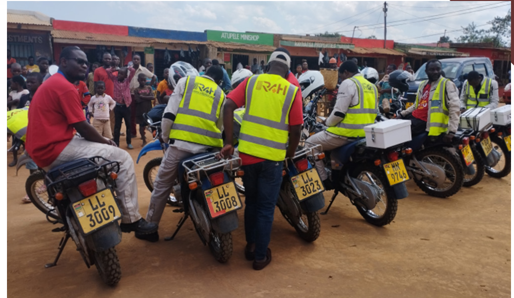
R4H Couriers & Staff at Kabudula Market during the End Polio Campaign.